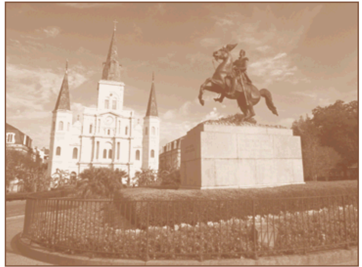
French Quarter balconies (left) and St. Louis Cathedral with Andrew Jackson statue (above).