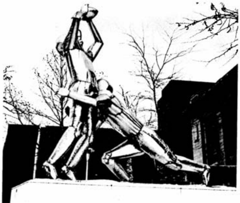
These tackles, made of nickel stainless steel, are the first things visitors see at the Canadian Football Hall of Fame.

Fabricating the two giant players was too large a project for his garage and most of the work was finished in the driveway of his home.