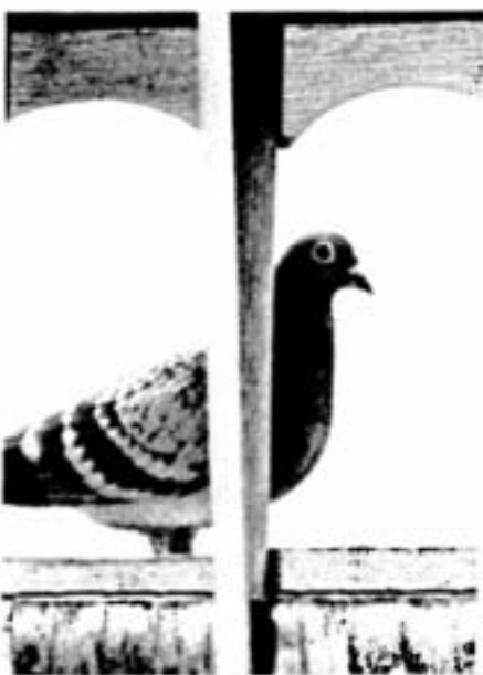
On the outside looking in: training the birds to enter the loft as soon as they come home is important because loitering outside can cost valuable seconds in a race.

What do a group of Inco employees and pensioners in Sudbury and Port Colborne have in common with Genghis Khan? They raise pigeons, that's what. The Khan used his for communications with his troops in the 12th century, but the Incoites race theirs.