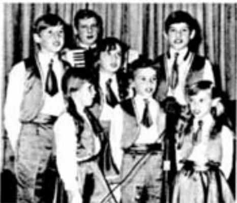
The seven Henkles, aged 8 to 17, sing in both English and German, besides performing traditional German folk dances.