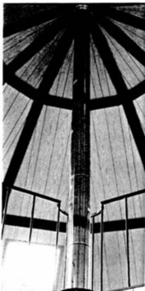
Percy's nickel stainless steel chimney.

The increase in sales and earnings over the first quarter of last year was due to increased deliveries, at higher prices, of primary nickel, copper and the platinum-group metals.