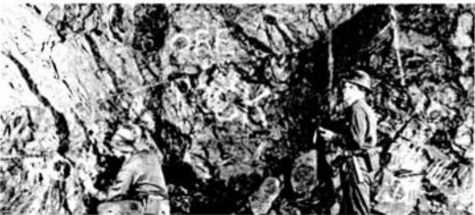
On 3600 level in Levack, area geologist Ellwood Wohiberg and mine geologist Al Smeeth mark the breast of a slope to indicate where the ore is for the miners.