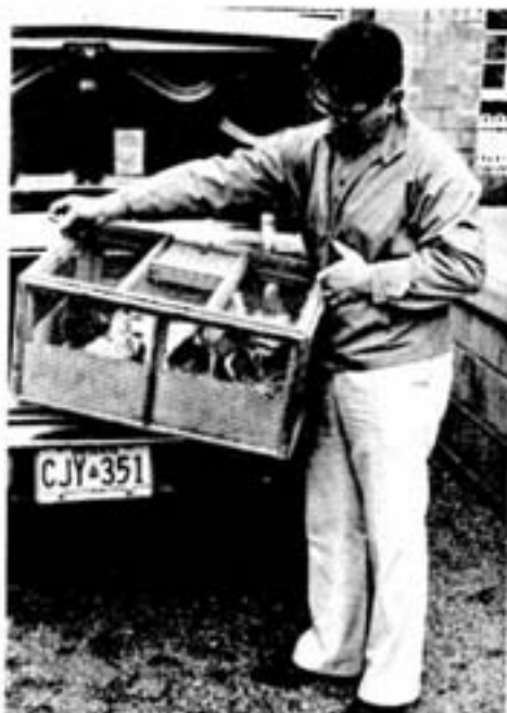
Martin's heavy duty cage can hold up to 25 pigeons. The birds are packed into the cage and then shipped to a distant point by railway. The station agent releases them and the race is on.

and trigger-happy hunters. The birds can drink on the fly and sometimes poison themselves by drinking from an oil slick. "Birds which do arrive safely, often enter the loft battered and soaking wet," Dan Lemaga said. "Oh, what a story they could tell."