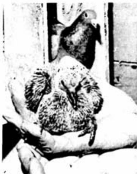
An anxious hen looks on as her "squeaker", or 20-day old chick, is man-handled gently by a fancier.