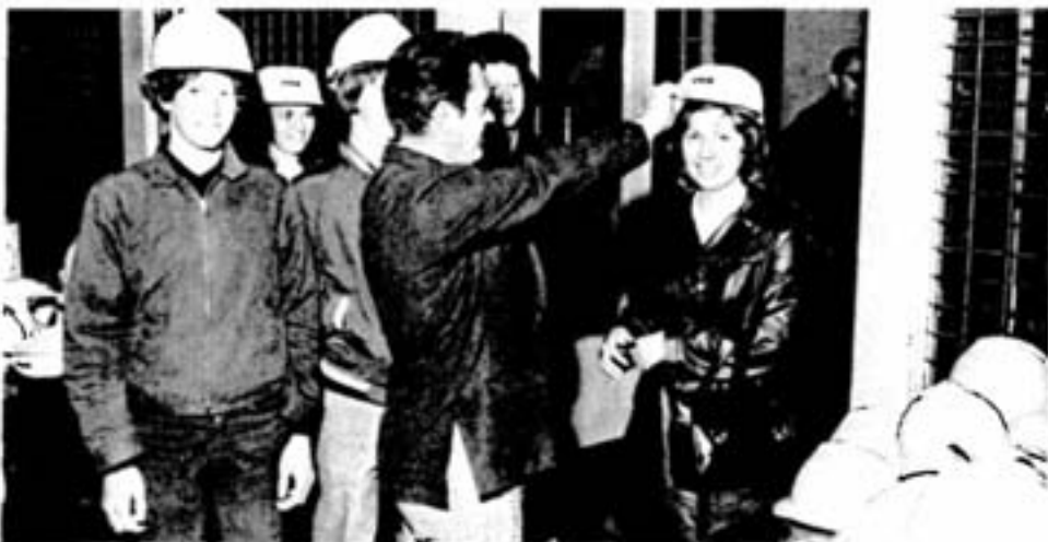
Every visitor to an Inco plant gets a hard hat and safety glasses and these visitors to Port Colborne's open house were no exception.