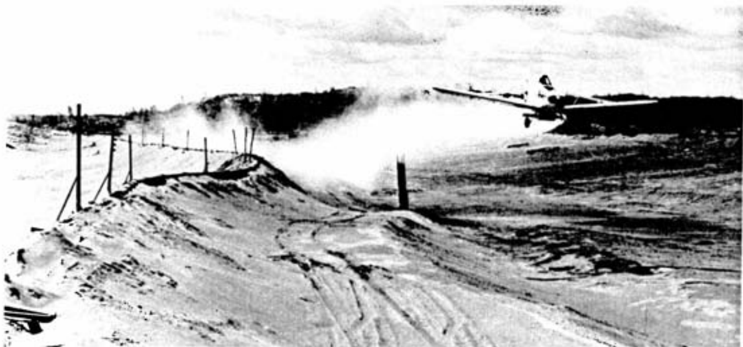
Always trying new methods to control the dust on the tailings areas, the agricultural department chartered this aircraft to spray a chemical binder to seal the surface.