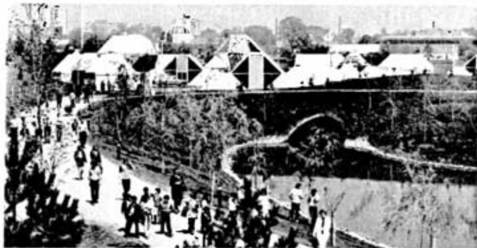
Ontario Place becomes Sudbury for one day June 30.