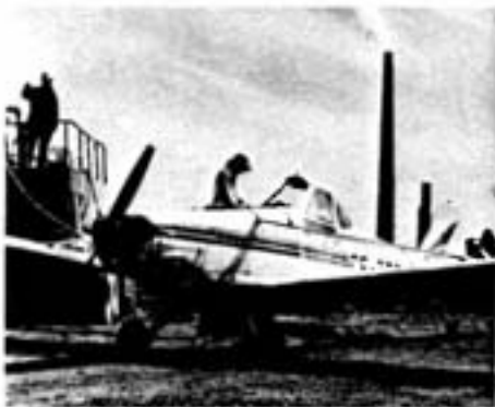
It took less than 65 seconds to fill the aircraft between flights. The truck was used to agitate the mixture of Curasol and water and pump the chemical into the aircraft's hopper.

Tom Peters, Inco's agriculturalist, stressed that aerial application of Curasol is only in the experimental stages. "We know that we can vegetate the tailings areas when they're finished. But what we need, however, is something to hold the dust before our reclamation work begins. We're constantly looking for methods such as this to help us control inaccessible difficult areas."