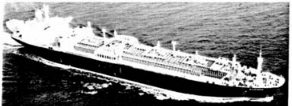
The tanker Gadinia, the world's largest carrier of liquefied natural gas, recently completed its maiden voyage.

Cryogenics, the world of the super cold, has been under research by Inco scientists since 1937. To date, 9 per cent nickel steel and Type 304L have been selected for over 75 per cent of the LNG tankers under construction or in service and over 60 per cent of all land-based tanks.