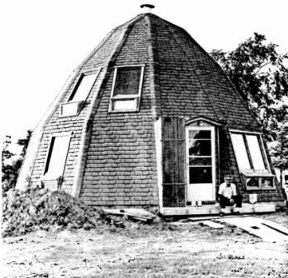
Percy Elsie's unusually shaped house is a curiosity for many motorists.

Heated by oil, the house also stands out because of its stainless steel chimney. An attractive asset to the interior decor, the chimney was also selected because of its proven durability and resistance to weathering and corrosion, an important feature in the Port Colborne area's damp climate.