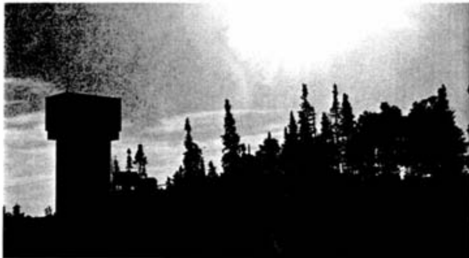
Inco's "ecological mine" at Shebandowan will be officially opened June 28.