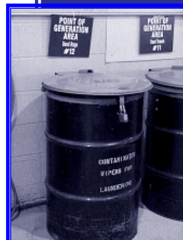
Proper storage of used rags

All laundries in Connecticut that handle industrial rags must have a wastewater discharge permit from the CT-DEP. Have your laundry service certify that they hold the appropriate permits and they are in compliance with the permit conditions. For a list of facilities that have valid discharge permits and their compliance status with the permit conditions, call the CT-DEP at 860/424-3018 and ask for the “engineer of the day”.