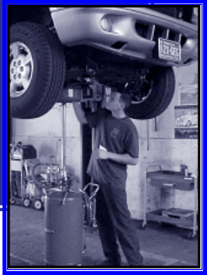
Vacuum-type drain system