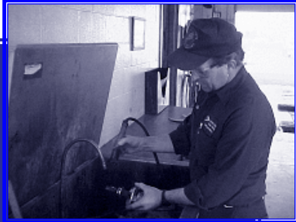
Using an aqueous-based parts washer.