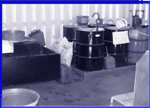
Container storage area with containment.

Adequate aisle space must be maintained around the containers to allow unobstructed movement of personnel and emergency response equipment. A minimum of 30-inch aisle space is recommended.