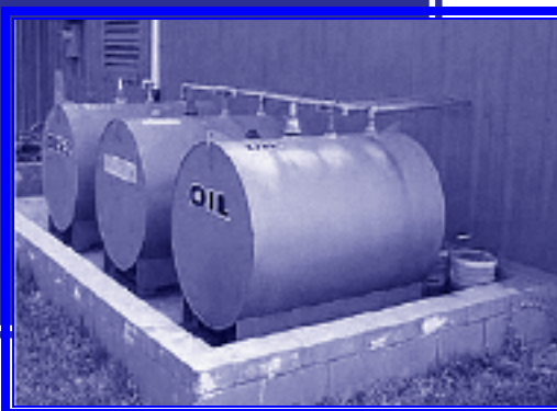
Aboveground tank storage of vehicle fluids.

If your facility stores oil (includes any kind or form, including gasoline) in aboveground tank(s) with a total aggregate volume of over 1,320 gallons (containers of less than 55 gallons are exempt) it may require a Spill Prevention Control and Countermeasure Plan ("SPCC") [40 CFR 112.1]. The SPCC Plan outlines a facility's oil containment systems and procedures to prevent spills and contingency plans in case of spills. The aboveground storage tank should be located within a dike or over an impervious storage area with containment volumes equal to 110% of the capacity of the storage tank.