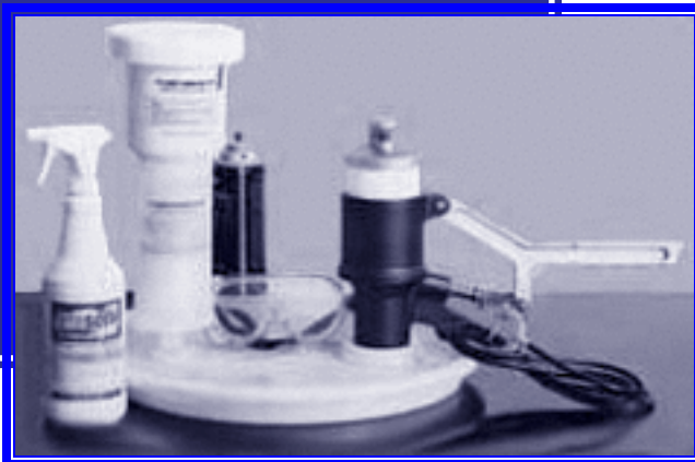
Example of a can puncturing device.

Any of the liquid or contained gases removed from the aerosol cans would be subject to regulation as hazardous wastes if they are listed in Subpart D of 40 CFR 261 or if they exhibit any characteristics of hazardous waste as described in Subpart C 40 CFR Part 261. Also, any filters or treatment equipment that contains residues from the cans must be managed as a solid waste and would be subject to hazardous waste determinations.