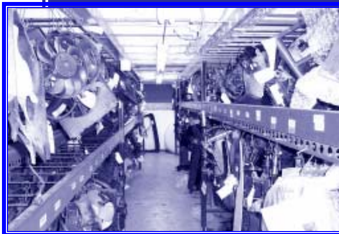
Parts stored for resale.

*Acutely hazardous wastes are a subset of hazardous wastes that are particularly hazardous, and are therefore regulated in much smaller amounts than regular hazardous wastes.