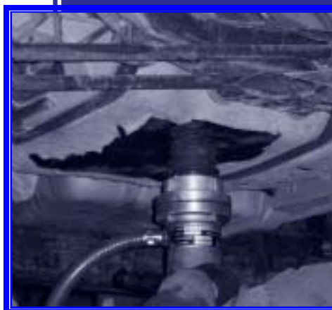
Draining gasoline from vehicle into storage tank.

Storing fluids properly helps cut down on the amount of contaminants that end up in stormwater. When fluids are removed, they should be transferred to the proper container. Fluid storage should be confined to designated areas that are covered and have adequate secondary containment. Keep drums containing fluids away from storm drains. Maintain good integrity of all storage containers. Do not leave open drain pans that contain fluids around the shop.