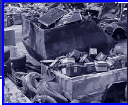
Batteries stored improperly.

Store lead acid batteries in fiberglass or plastic containers made especially for battery storage.