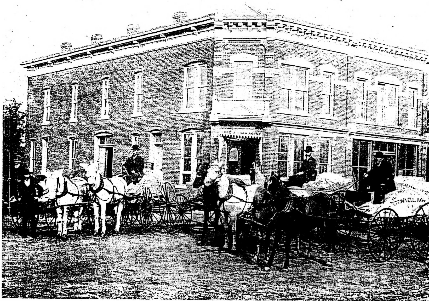
GERMAN BANK OF WALNUT, IOWA