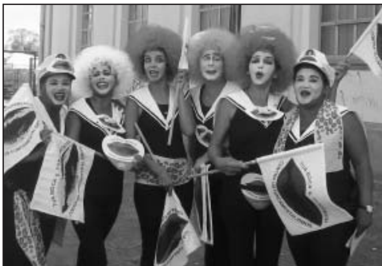
Members of the Brazilian women's theater group Loucas de Pedra Lilás, who use humor to promote women's involvement in gender issues and current affairs, at the World Social Forum in January.