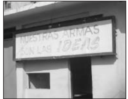
"Nuestras Armas Son las Ideas": A garage/car repair shop sign in Vedado, Cuba, translates as "Our Ideas Are Our Weapons."

Also hidden from the headlines is $36 million budgeted to promote dissidence. The commission's report describes how youth, women, and Afro-Cubans can be courted to turn against the existing government. For example, it speaks of "grants of U.S. funds [that] could provide the critical spark to activate more of the Afro-