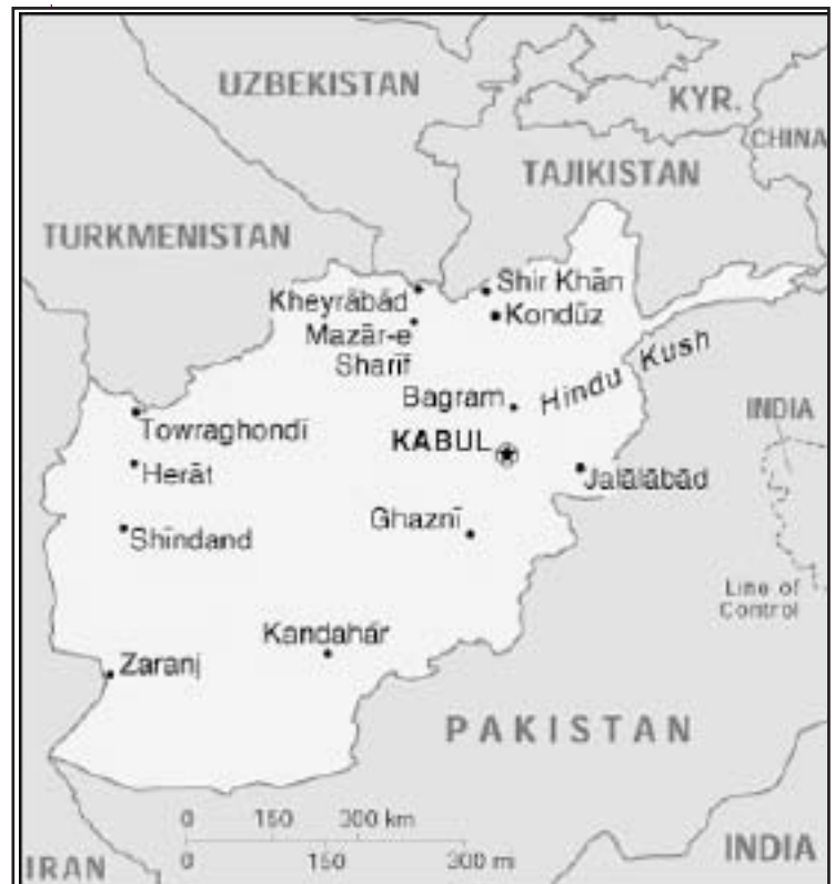
Map of Afghanistan in relation to its neighbors.

The lack of justice, anywhere in the world, is a major obstacle to attaining a lasting peace. Racial, economic, gender, and religious justice are not only rare,