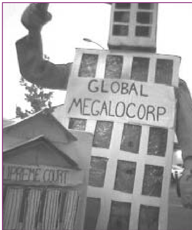
WILPFers perform street theater about corporate influence.

The mainstream corporate media has never questioned the motive for invading Afghanistan. It has mistaken the excuse (9/11) for the motive. As a result, conversations within the civic community rarely consider what we believe is the primary motive for that war: profit in the form of control over oil. While many (especially women) are glad to see the former Taliban rulers gone, they may not know that before 9/11 the administration had already been working with the Pentagon on a plan to invade Afghanistan. Even back then, restoring human rights was not the impetus. The Taliban was refusing to