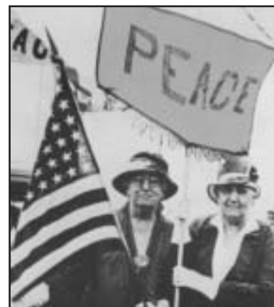
Jane Addams, left, in action.

Globalization and Militarism: The U.S. Reach for Empire (1:16)