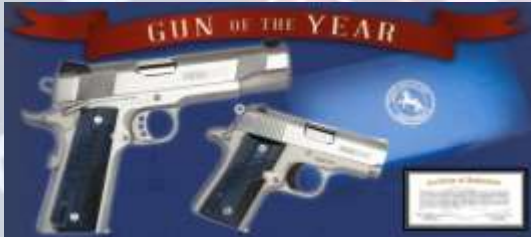
Colt XSE Gov't 5" .45ACP & Defender 3" .45ACP