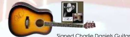
Signed Charlie Daniels Guitar