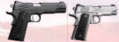
KIMBER CUSTOM II & PRO CARRY II