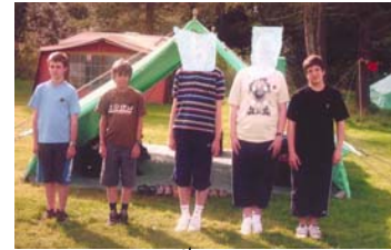
2 nd Bovey Tracey / 1 st South Molton