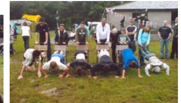
the press up competition for the District superstars with the dining hall behind