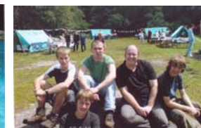
5 th Exeter members looking down the field at the stalls