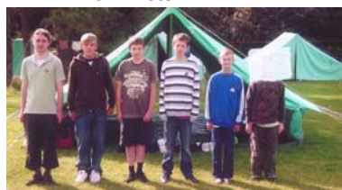
10 th Exeter