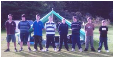
1 st Exeter