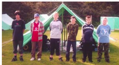
2 nd Bovey Tracey / 2 nd Paignton