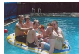
5 th Exeter in the swimming pool during camp

Saturday 16 th June was the day of the Broadleas fete at Haytor on Dartmoor. The weather was changeable, warm bright sunshine, then ten minutes later heavy rain. These photos were taken during a brief sunshine break.