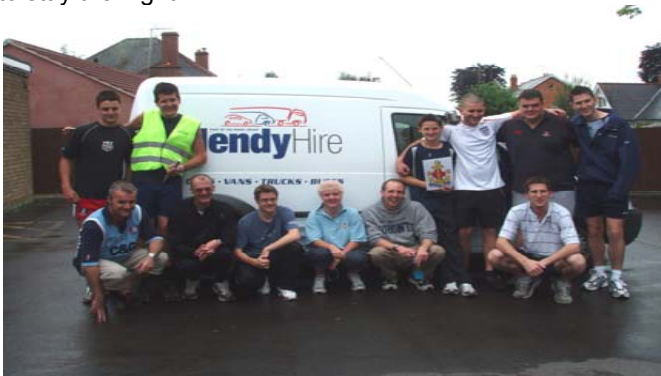
Start from Hucclecote

At 8.30am in the morning we started our second day, running from Winford near Bristol to Cullompton in Devon which was a staggering 70 miles. We finally reached Cullompton at 6.15pm and then went back to Taunton to stay at Rowbarton Methodist Church. Six of our party returned home that evening to be replaced by four of our younger Boys.