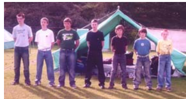
5 th Exeter