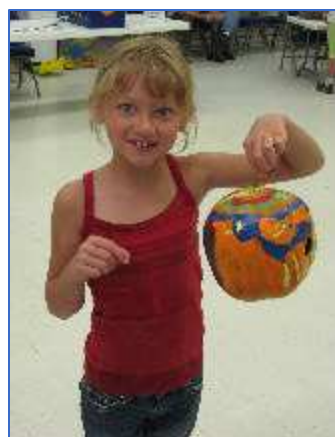
A young Bird lover showing off her gourd creation

Visitors went on two bird walks with Floramay Miller, with the Bismarck Birding Club. Using binoculars they were able to learn tips and tricks of bird watching.