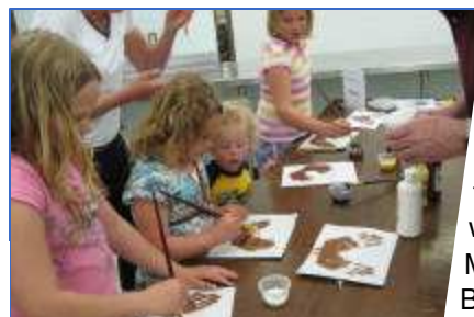
Children using their handprints to make eagle paintings

Volunteers assisted visitors in painting a picture of a Bald Eagle. (pictured below) Cool Fact: The record for a bald eagle nest measured 20 feet