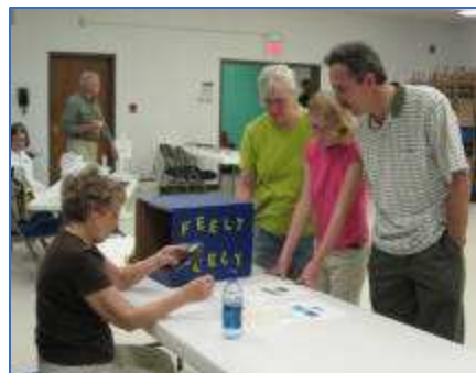
Visitors check out the 'Feely Meely' box

Gateway to Science held the 3rd Annual A Day for the Birds on June 7th with over 60 participants and several local volunteers. Our goal is to increase the public's awareness, appreciation, and knowledge of birds and bird watching. Visitors to Bird Day 2008 were able to experience the