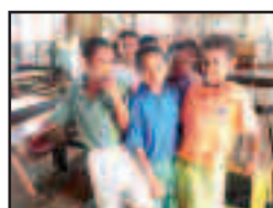
Pictured on front cover: Boys from Grade 3 – St Paul's School Wedau, Milne Bay Province PNG.