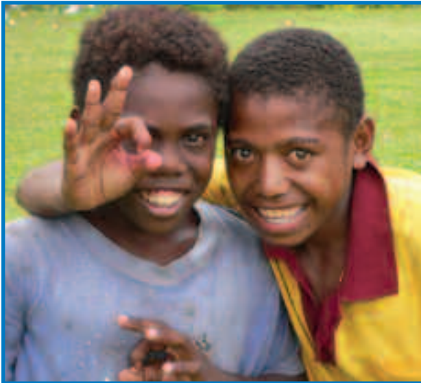
Children in the New Guinea Islands where ABM supports two regional Youth Coordinators. Brad Chapman.