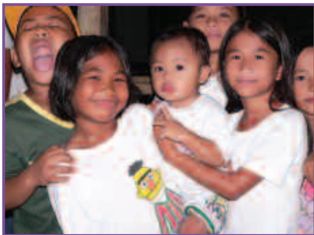
The work of the Episcopal Church of the Philippines is changing the future for children throughout the country.