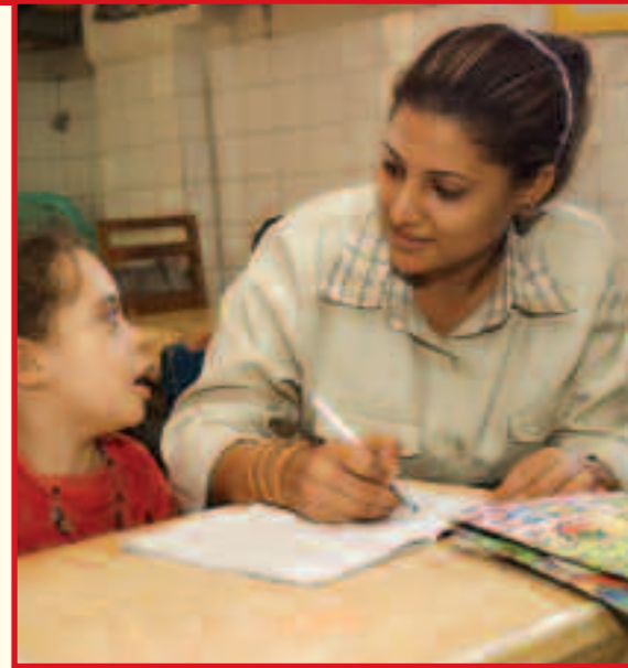
ABM working with our Partners for Love Hope and Justice.

For Parishes/Schools and Groups: make a decision about what you would like to support in 2007, and how much you think you can raise. Please also consider a second project – just in case the one you choose first is fully subscribed. Then turn to page 25 and complete the form.