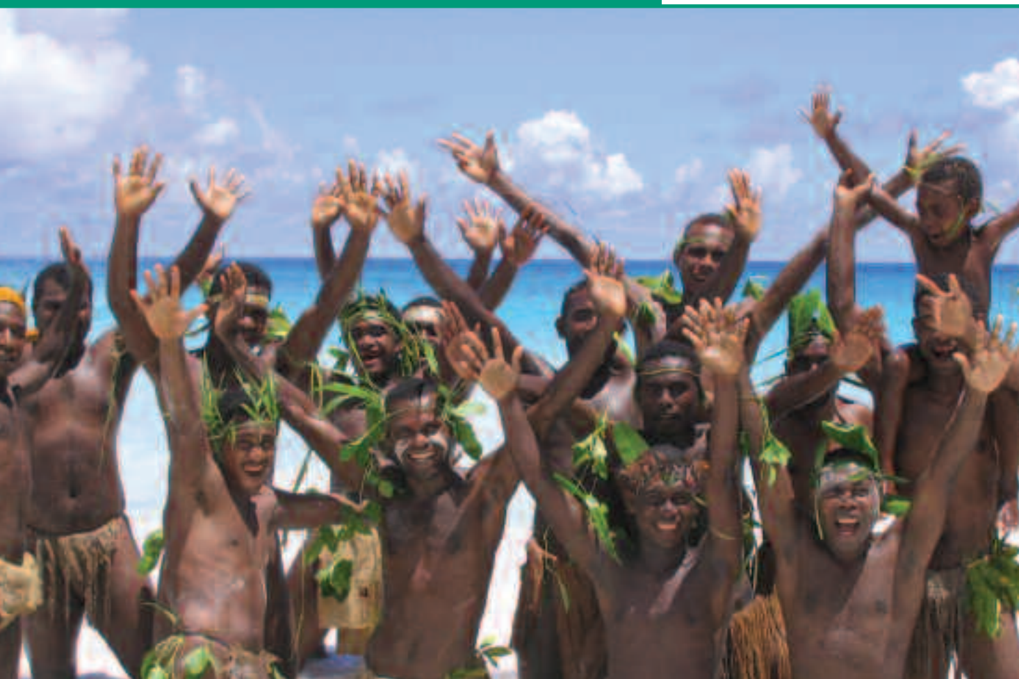
Celebrating Christmas Melanesian style at Ulawa, Solomon Islands.

The Solomon Islands Program is resourcing the Anglican Church of Melanesia to undertake development projects, continuing on the path to long term rehabilitation after the civil conflict. The program is also applied to Vanuatu who with the Solomon Islands and New Caledonia make up the Province of the Church of Melanesia.