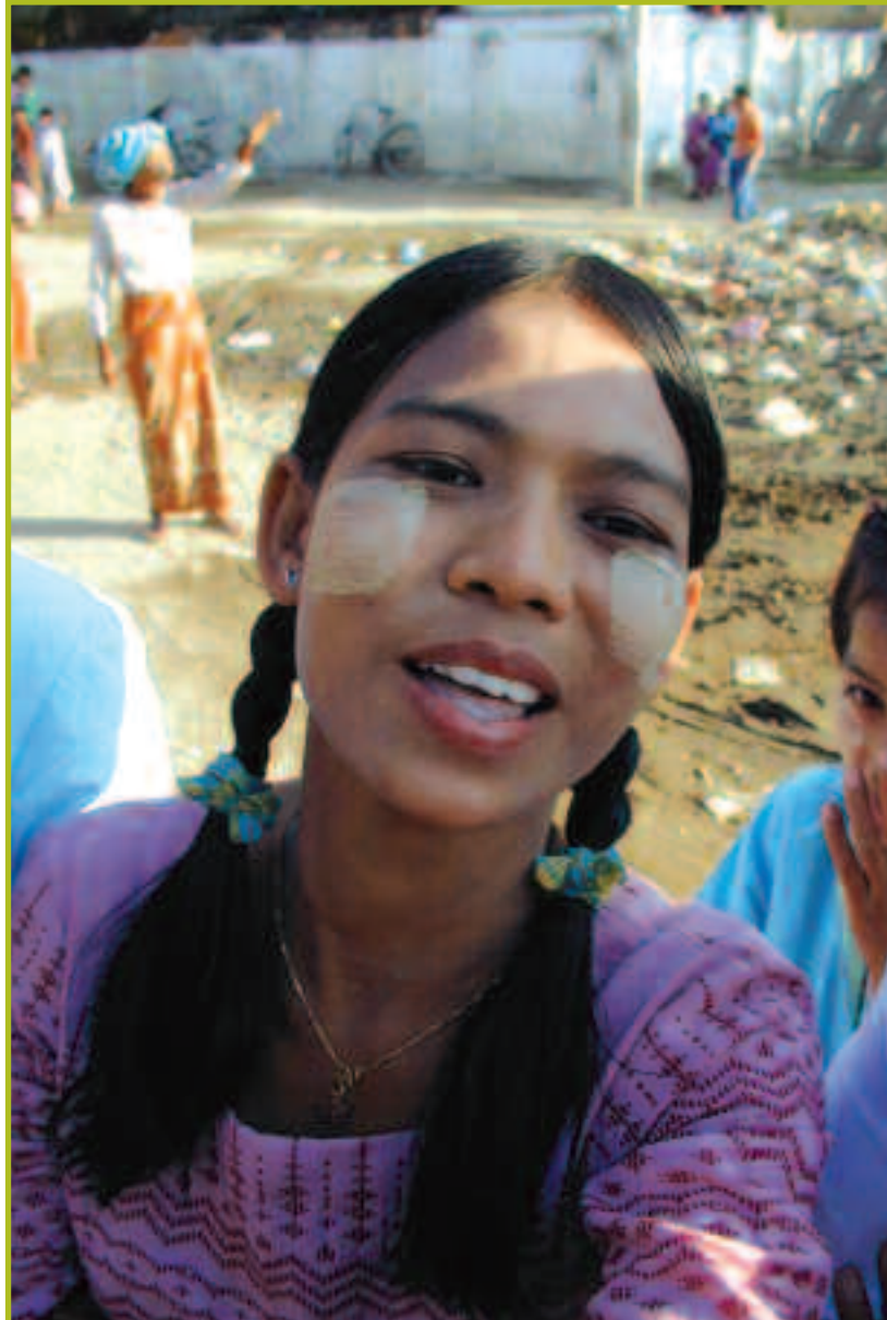
This young woman dreams of a future that is full of hope for her and her family. The Church in Myanmar is committed to developing the capacity of each of its six dioceses and seeking to alleviate poverty amongst the people. This is particularly important within the rural and remote areas of the country.