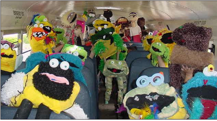
Hendy fourth-graders hold their puppets on the bus ride to Bethany Courtyard.