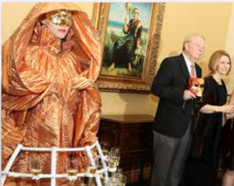
Cirque USA entertainment included acrobats, a "living red carpet", and this unique champagne presentation.

The Leesburg Regional Medical Center Foundation is a 501 (c) (3) tax-exempt organization and all contributions are tax deductible to the extent allowed by law.