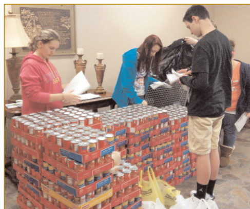
Page Baptist Church Jr. High Caravan Club kids put "Jesus Loves You" labels on soup cans.

Recently, the congregation of Page Baptist Church (Fayette) donated to the Fayette Plateau Ministerial Association Food Pantry. Each month, a different food item is collected - with one of the winter items being soup. Approximately 2,000 cans of soup were collected to benefit this community service project. The American Baptist Men will deliver the soup to the food pantry for distribution this month. We feel blessed to have young people who are interested in sharing the love of our Lord while serving others.