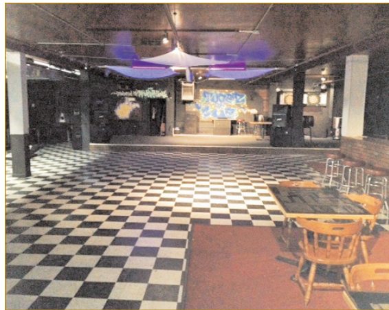
The Cue - a Campus Christian Center comes to West Virginia University Baptist Campus Ministry.

This is a crucial time in a college student's life to find positive influence and accountability to strengthen their faith in Jesus Christ during their college years. This facility will hold