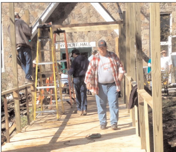
The men work to enlarge the bridge to Hylbert Hall.

Where people meet Jesus and grow as His disciples in a community of faith.