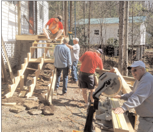
Participants in the men's work party build a porch and stairs for the Clarksburg cabin.

Next year's spring work party will be held April 29-30, 2016. Please put that on your church's calendar and bring a group of men to Camp Cowen, "Where people meet Jesus and grow as His disciples in a community of faith."