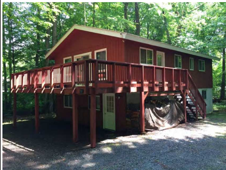
111 Tunkhannock Trail, Pocono Pines, Pa. 18350

One lucky member will win the drawing for a free weekend! Hope to see you!