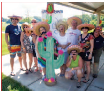
A big thanks to the River Float Committee for a great Dutchmen day!

THE FLYING DUTCHMEN Ski Club Of Reading, Pennsylvania, Inc.