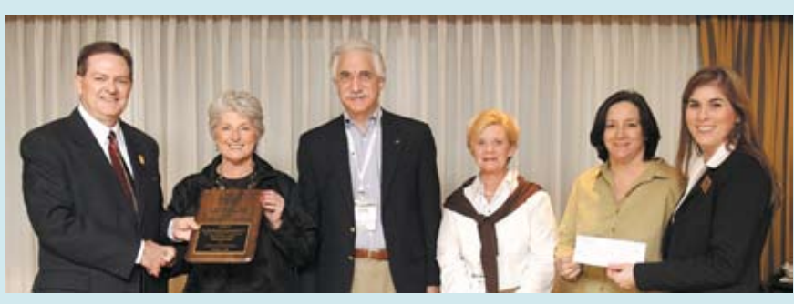
Advancement to Nursing Program, Akron, Ohio