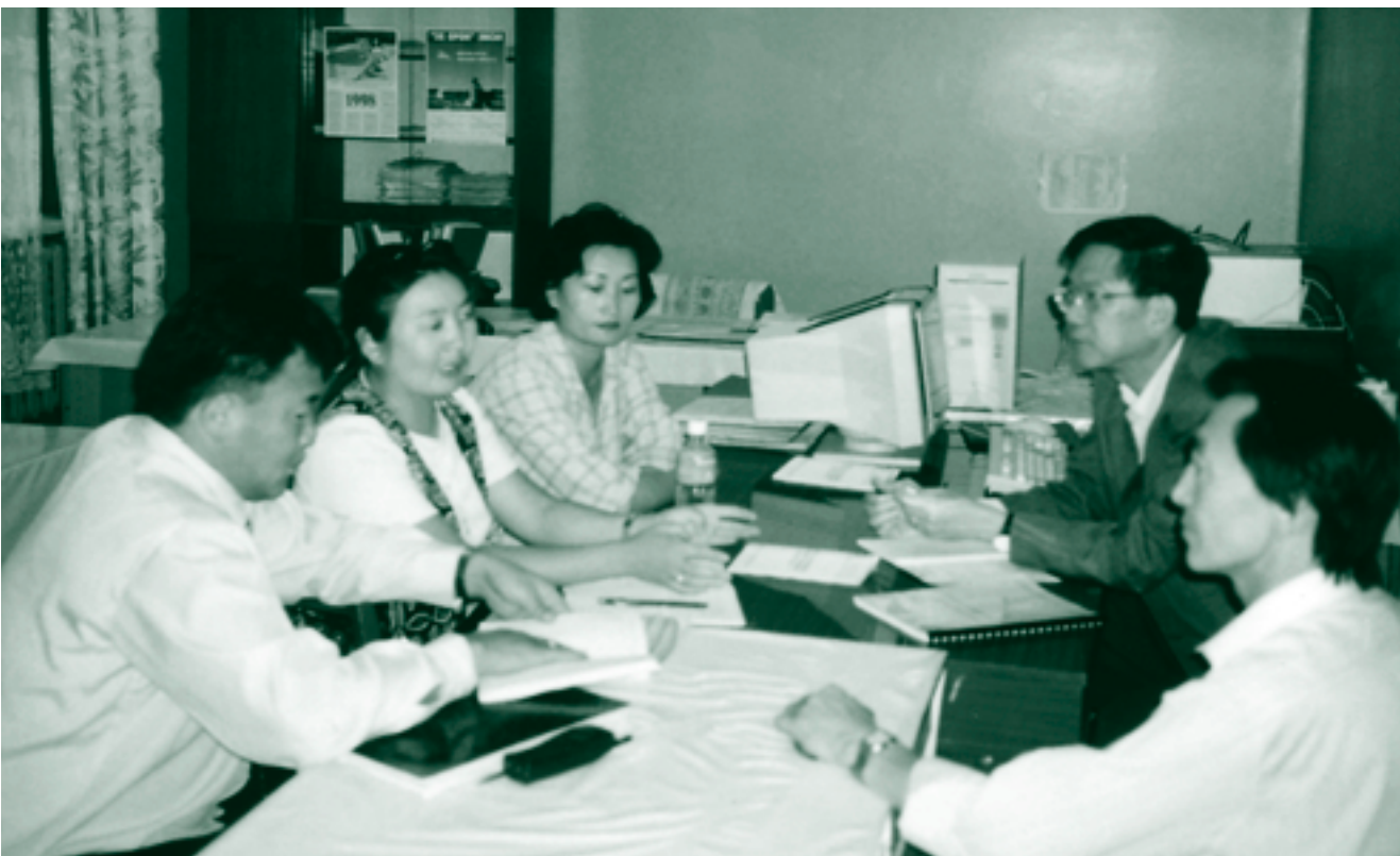
Discussion on how to streamline morbidity/mortality reporting.