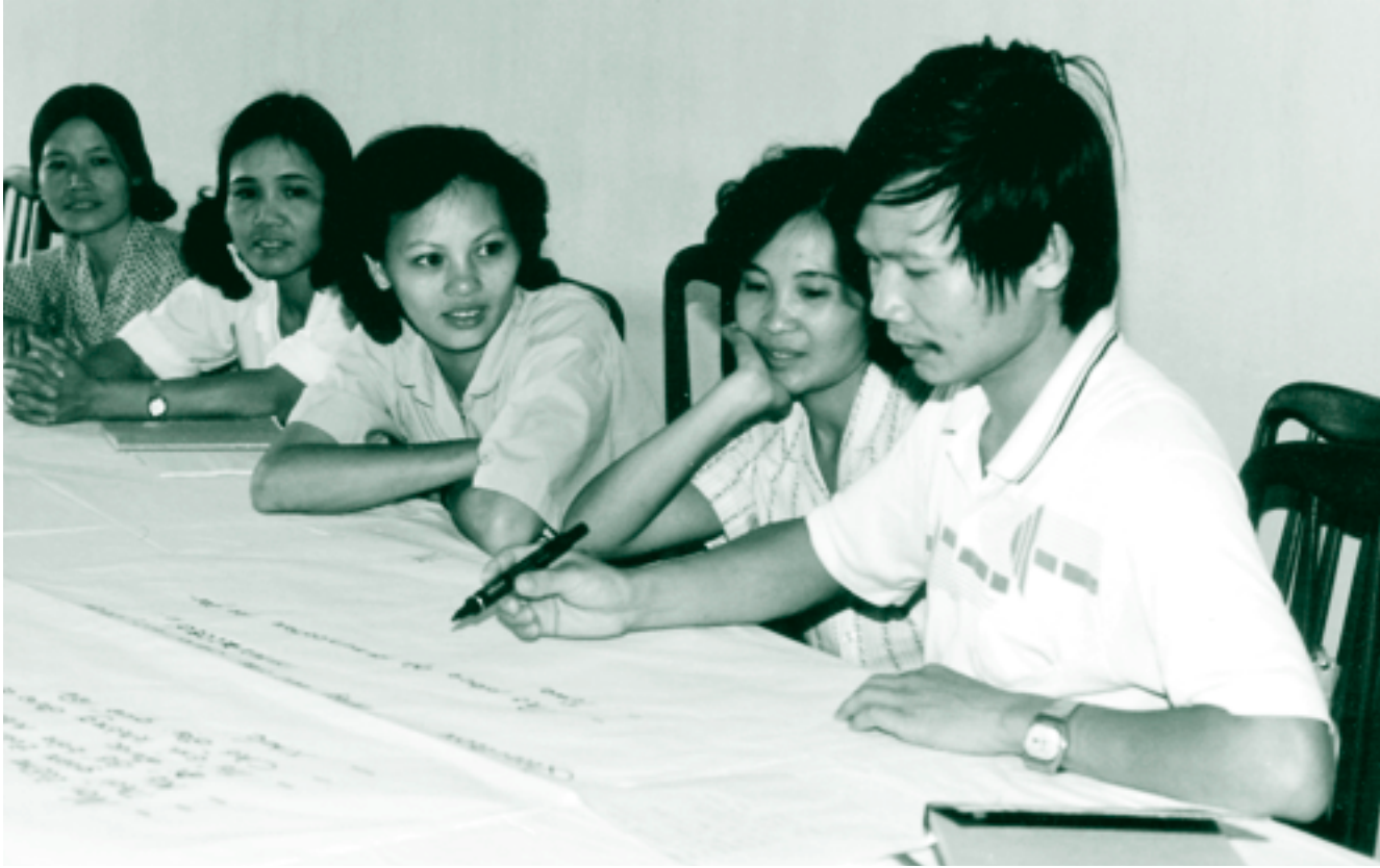
Group discussion on selecting relevant health indicators.