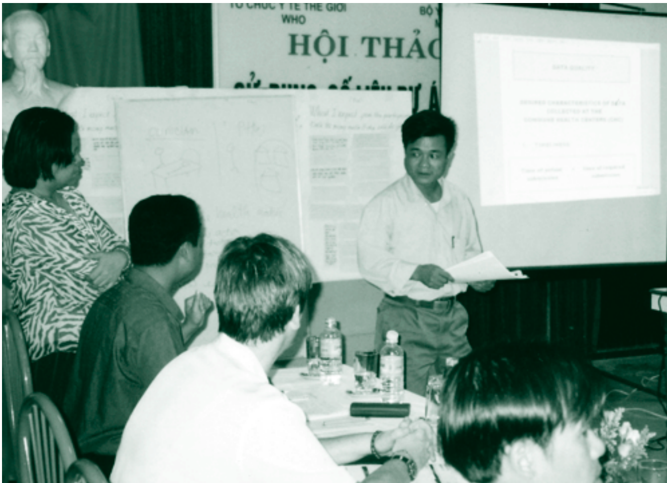
Training seminar on data use.