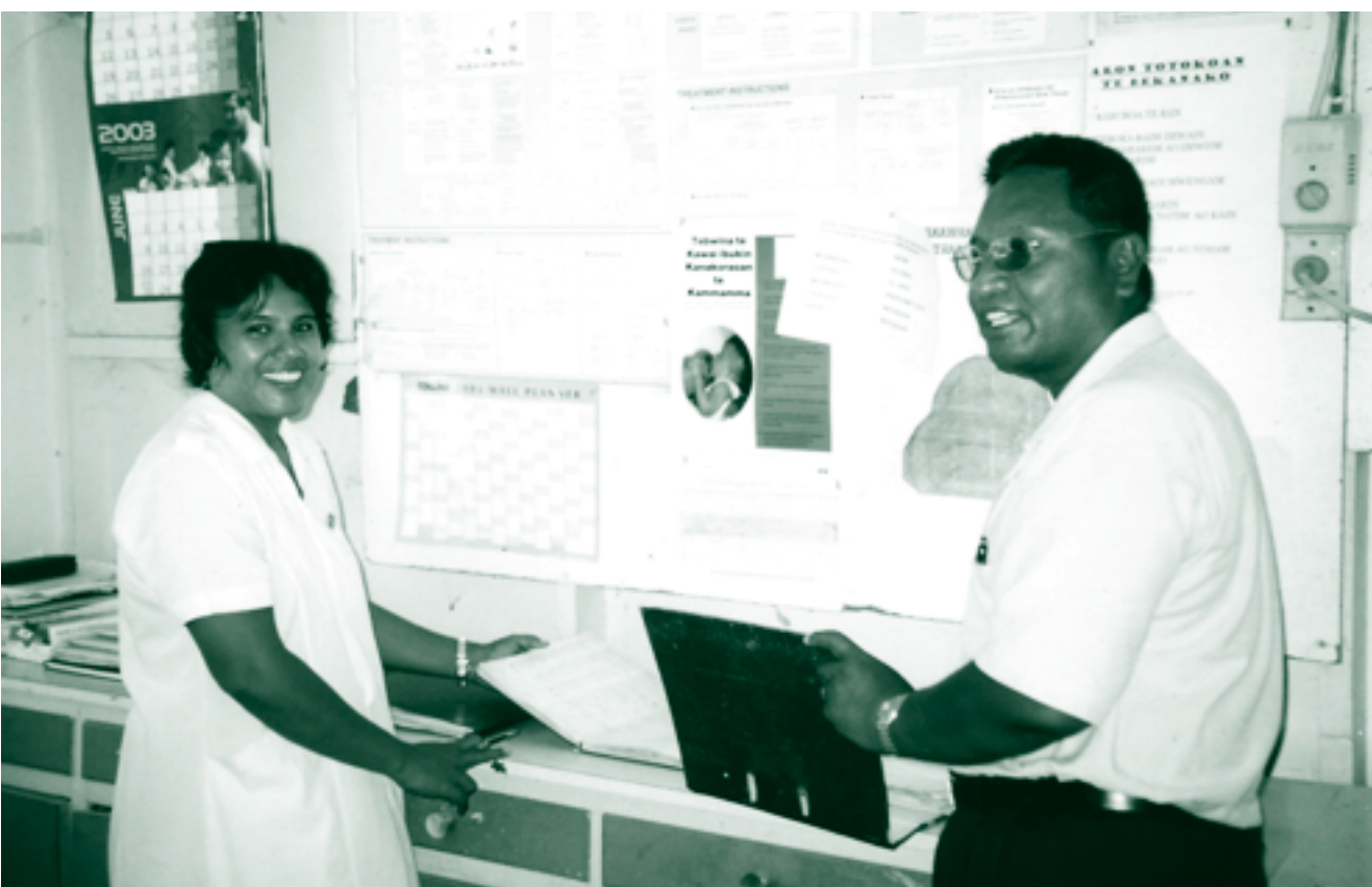
Checking data entry work at a health centre.