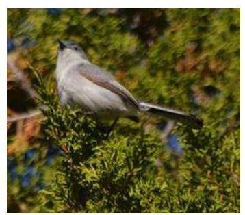
Blue-Gray Gnatcatcher in Cottonwood Canyon

While at Daily Lake in Paradise Valley April 28th, Richard Backstrom spotted an albino Black-billed Magpie with a flock of typical magpies.