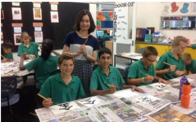
Year 6 students mastering the art of shodoo (calligraphy)