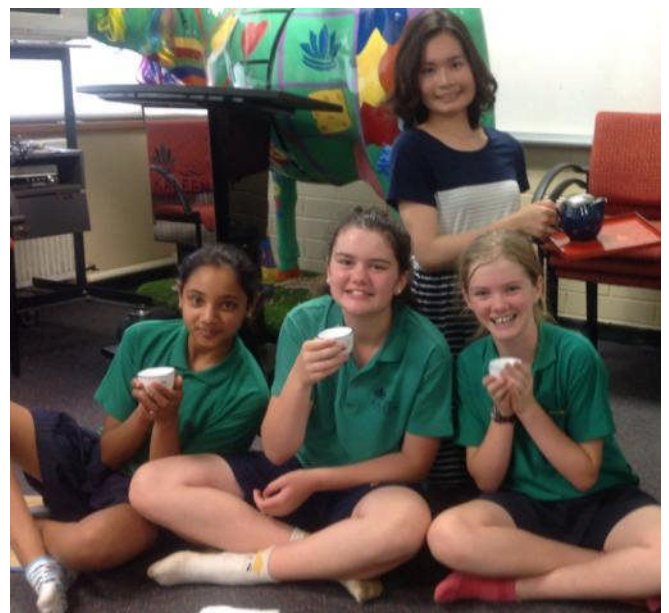
Year 6 students participating in sado (Japanese tea ceremony)