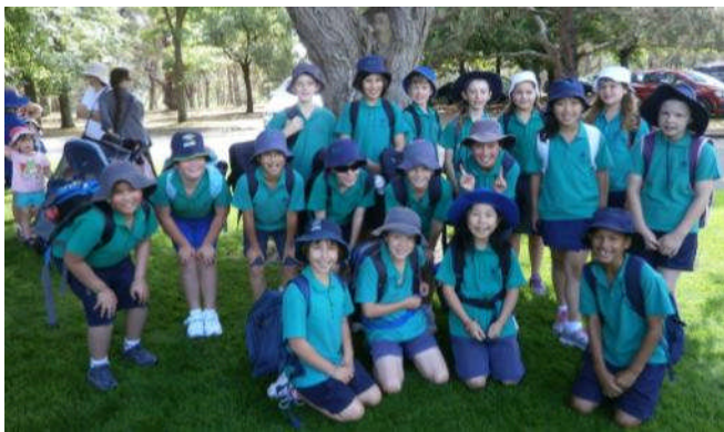
Some Year 4 students in the grounds of Government House