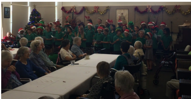
Senior Choir students giving one of the most precious gifts – time – to the folks at Kangara Waters.