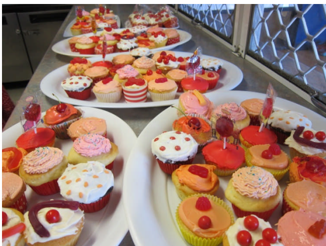
Fabulous fundraising efforts towards a very worthy cause.