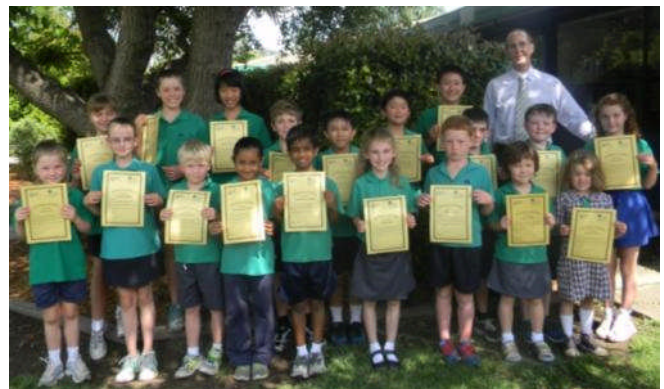
Term 4 Golden Letter recipients