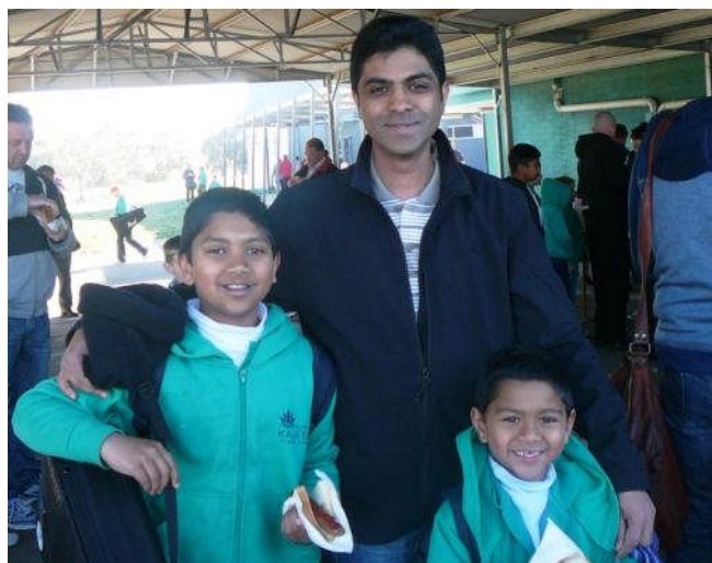
A great turnout for our Father's Day BBQ