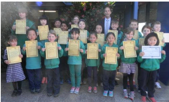
Golden Letter recipients for Term 3