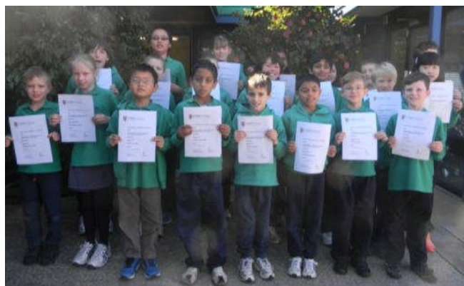
High distinction and distinction recipients in ICAS Science

Congratulations to the following students on their outstanding results in the recent University of NSW International Competitions and Assessments for Schools (ICAS) Science tests: