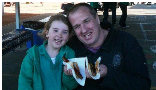
Smiles all round