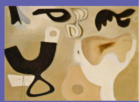
AGNES MARTIN, UNTITLED, 1953, OIL ON CANVAS, COLLECTION HARWOOD MUSEUM OF ART