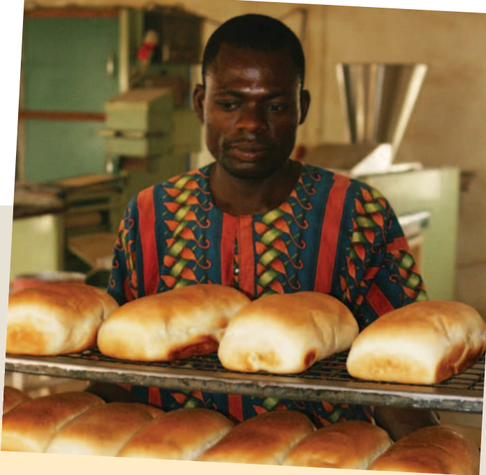
Your support means more people have a chance of a better life.