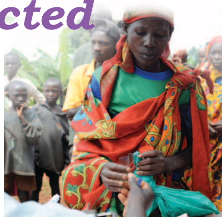
A staggering number of people are at risk of disability due to neglected tropical diseases.

Another three major NTDs, all traceable to parasites, include Elephantiasis, soil-transmitted Helminths, and Schistosomiasis. All are treatable with good outcomes if caught in time - and the average cost of treatment is only 35 pence per person per year - because most drugs are donated by the companies who make them. Read more about what your gift can achieve on our website at cbmuk.org.uk/NTDs