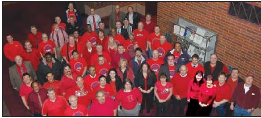
District 751 Stewards, Officers and staff wore red on Feb. 3rd as part of the nationwide effort to raise awareness of heart disease, particularly in women. The 751 Women's Committee promoted the effort.

1999 PONTIAC BONNEVILLE, exc cond inside and out, runs great, all maint records, low miles (121,600), 3.8L 240HP 3800 series V6, $2,950 OBO. 253-517-5754