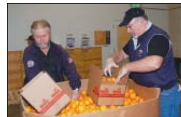
Above and left: Stewards and their family members packaged 20,900 pounds of oranges for distribution to area families.