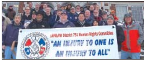
Some of the 50+ participants from 751 pose behind the Union banner before the start of the march despite snowy conditions.