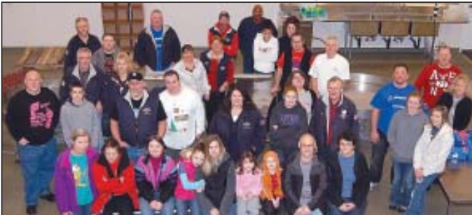
District 751 volunteers turned out over winter break to help at the Northwest Harvest Warehouse in Kent.