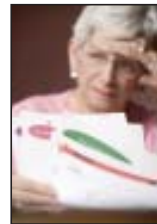
Seniors may qualify for reduced bills from Seattle City Light.

To apply, you'll need to provide income information for all members of the household and information about your home. To find out more or get an application, visit www.seattle.gov/UDP or call 206-684-0268. That single application could also qualify you for assistance with your water, sewer and garbage bills.