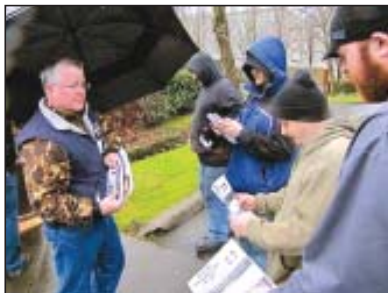
At the barbecues, members also heard an update on negotiations and had a chance to discuss the issues.

Members are also concerned with Hytek management's proposal for job classifications and that lack of training