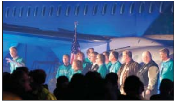
At the second shift celebration, Boeing asked Union leaders to share the stage during the formal program to symbolize the significant role the Union played in ensuring the 737 MAX is built in Renton.