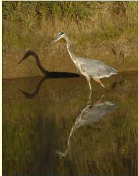
Great Blue Heron ( Ardea herodias) hunting at sunset, Olentangy River Wetlands Research Park, OH.