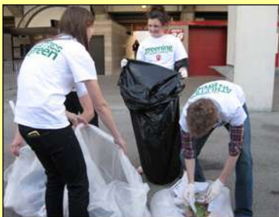
Volunteers participate in "Greening Cream & Crimson," part of a comprehensive effort to make IU Athletics a sustainability success story

The newly created Office of Sustainability (IUOS) used the Campus Sustainability Report for a roadmap; many of the former Task Force members now serve on a new Campus Sustainability Advisory Board which has seven Working Groups, each with 20 to 30 members. A new Student Sustainability Council, made up of student leaders from 22 student organizations, also provides input and assistance to the Office of Sustainability. This group recently gathered 11,000 petitions to start a Student Sustainability Fund, which will be funded through a voluntary $5 donation at registration.