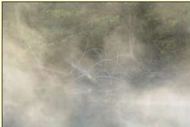
Foggy sunrise, Taloden Pond, Highlands Nature Sanctuary, Highlands County, OH.

My husband is recovering from brain cancer--two brain surgeries within a year; my mother's in hospice care. So mostly I'm working on walking this journey with grace and wisdom (and chronicling what I learn, memoir in real time as it were, on my blog, http://susanjtweit.typepad.com ). In terms of writing, I just finished narrating the audiobook version of my memoir, Walking Nature Home --it'll be released by Redwood Audiobooks later this year. I also just released another audio project, WildLives: Celebrating the World Around Us , a CD collecting some favorites from 20 years of weekly radio commentaries on nature near and far. And I'm working on a mystery and a garden/cooking memoir.