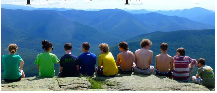
Base Camp Nature Learning Center, NH unless specified ME