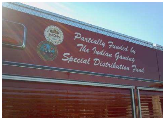
NCF Engine-1114 Graphic acknowledging NCFPD/IGSDF partnership (FY 2010-2011)