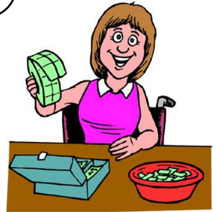
Esther's Daily Raffle Ticket Sales