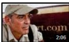
George Clooney: Endgame in Sudan