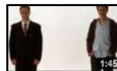
I'm a Mac... and I've Got a Dirty Secret

*Find more by visiting Enough's YouTube channel