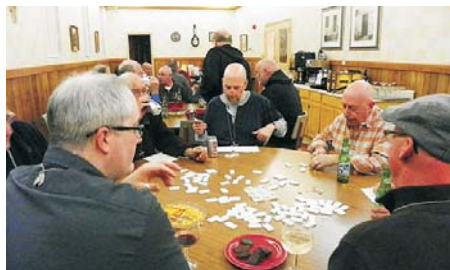
"Mexican Train" domino matches formed a central part of the evening recreation.

ongoing round of ministry to others as provided by himself and his closest disciples was nourished, restored and supplemented by taking time apart—time for restoring the body, the soul and the mind through rest and refreshment. Common prayer and intercession is the spiritual lifeblood of our religious community, and any gathering of Gregorian Friars will have that element as focus for all else—and Winter Convocation 2012 was certainly no exception as the four-fold Daily Office provided the structure that calls us back again and again to that deep and abiding relationship with God in Christ Jesus our Lord. And supplementing this holy time was always the sound of