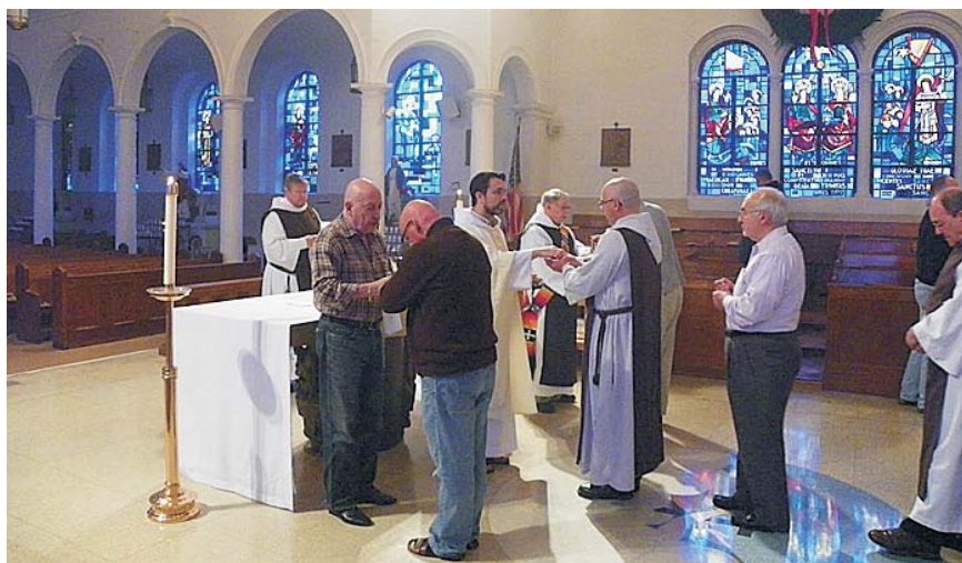
Worship is a major element in each day of the Winter Convocation.

As inspiration for these annual gatherings, one need look no further than the Gospels themselves as they recount Jesus' leadership by example in making sure that the